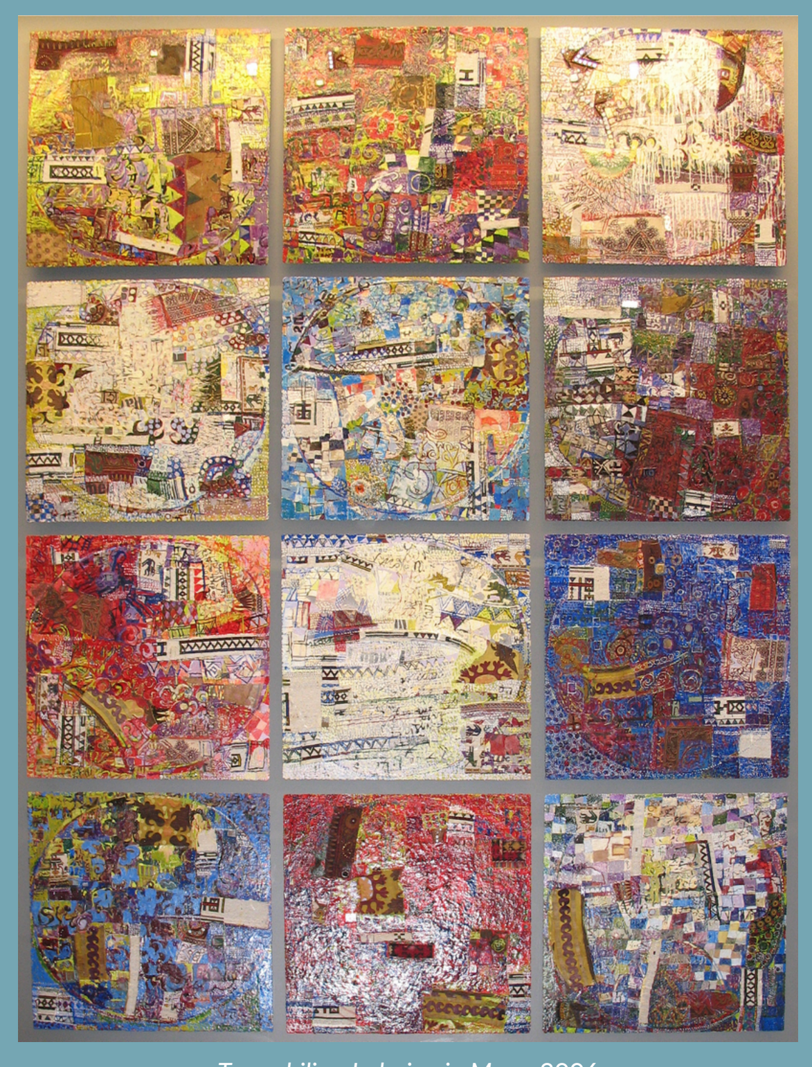
Topophilia - Imbuing in Maru, 2006 Oil paint and mixed media collage on aluminum panel