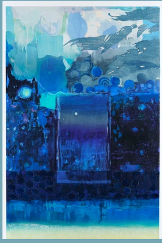
Verse · Space — Field 2, 2022 Mixed media print: Digital, silkscreen, stencil, and wood block.