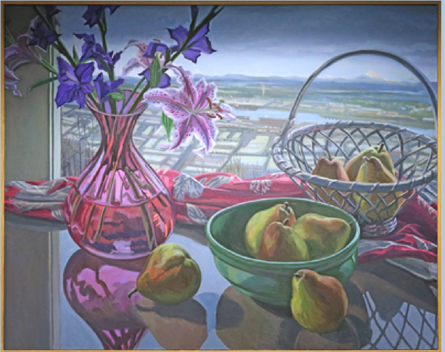
Comice Pears & Mt St Helens, 1996