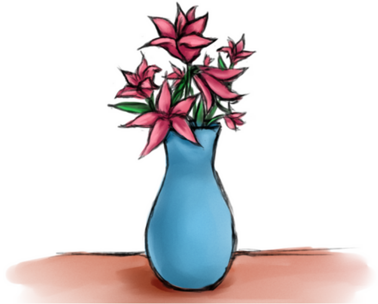
Example of completed still life

Video: Value (Elements of art for kids 6th grade)