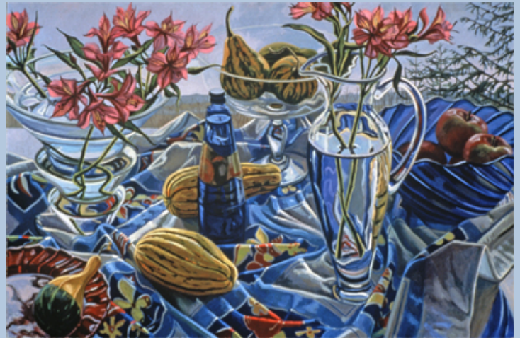
Crystal Water, 1996