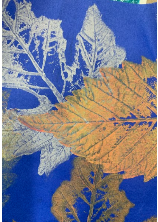
Example of completed leaf print