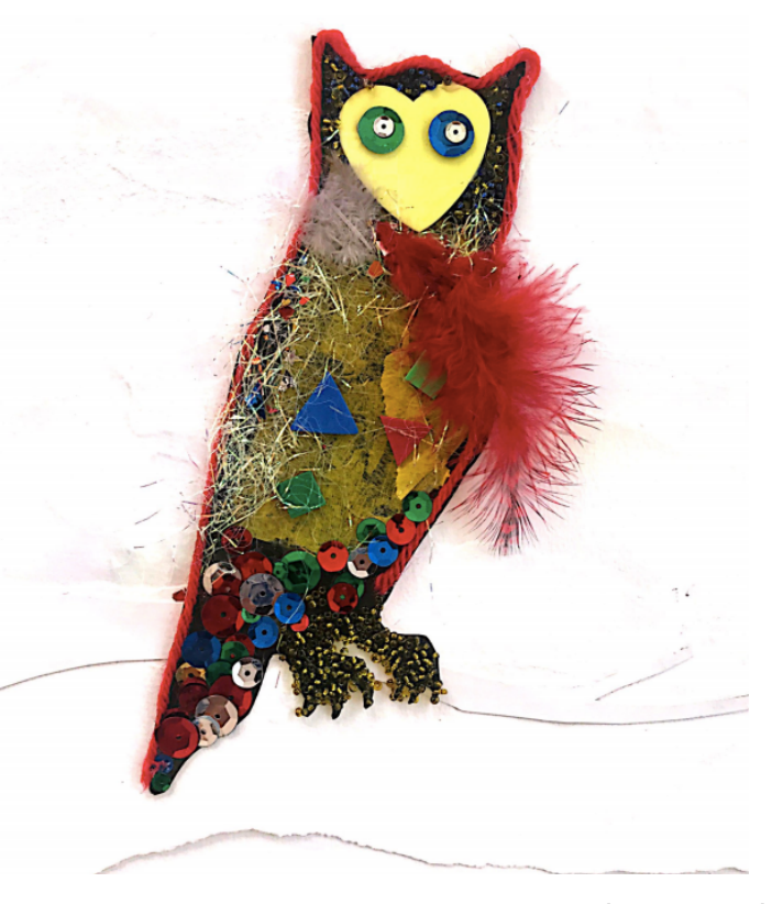
Student Example