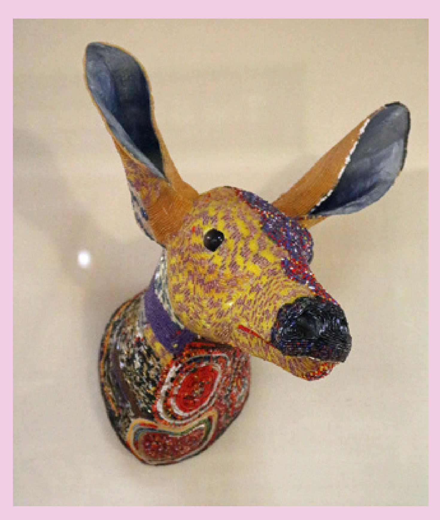
Patterned Fawn, 1984 Artwork copyright Sherry Markovitz.