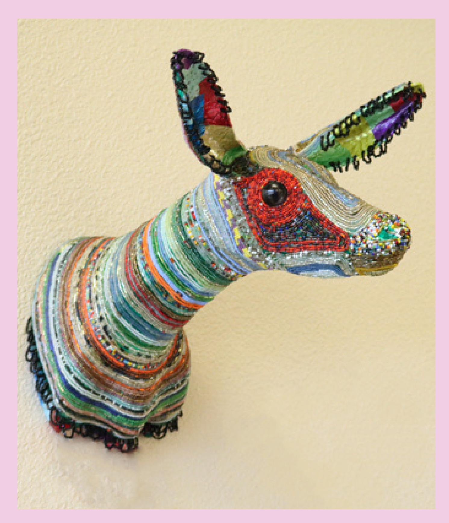
Curiosity, 1986 Artwork copyright Sherry Markovitz.